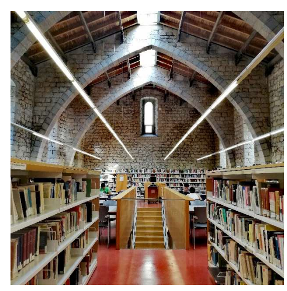
Clarissa F, Universidad de Girona, Spagna, a.a. 2019/2020

TRAINEESHIP: if carried out under the patronage of the host institution and correctly included in the OLA. Max. duration 2 months