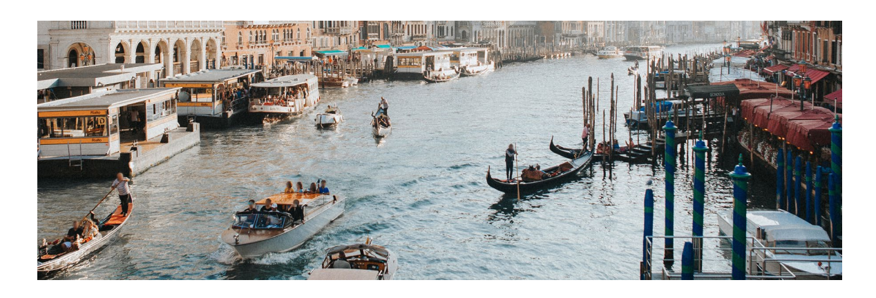
Students: your stay, insurance, transport