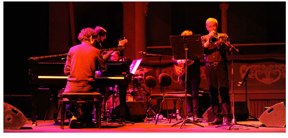
University Orchestra and Choir