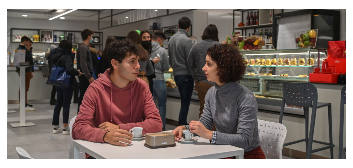
Housing and canteens