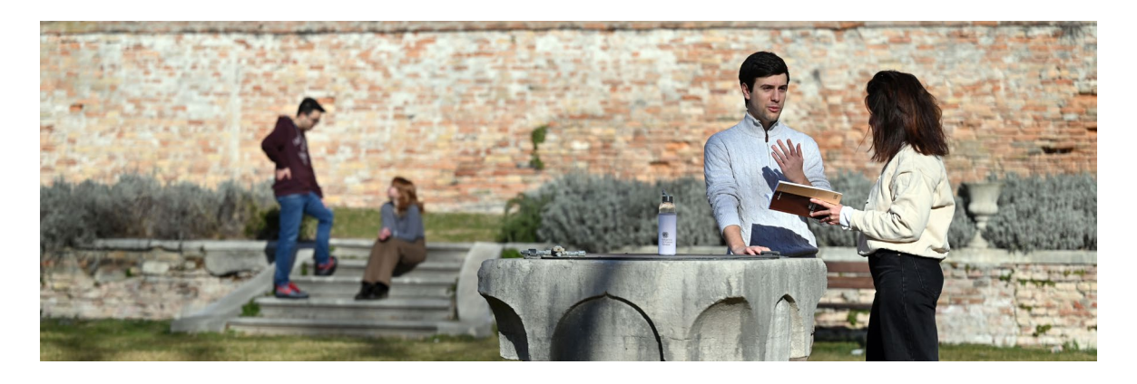
University Language Centre (CLA)