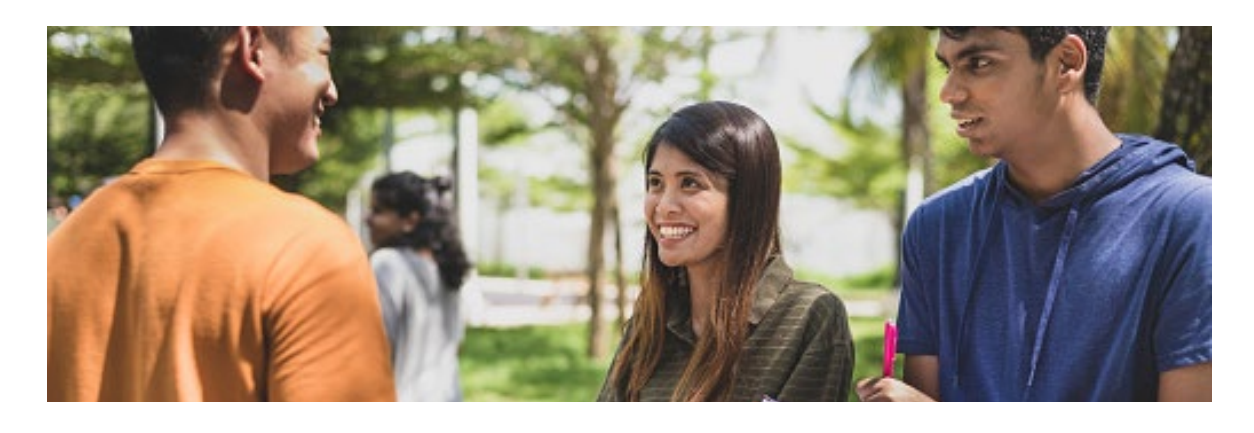
Ask the tutor