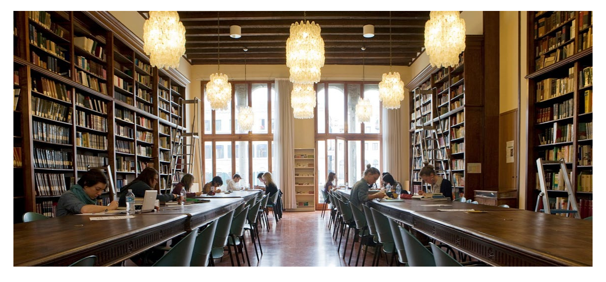
University library system