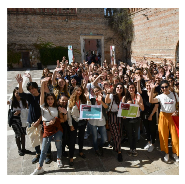
Enjoy Ca' Foscari