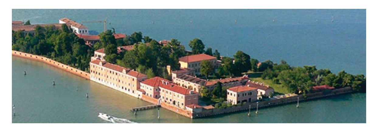
Venice International University