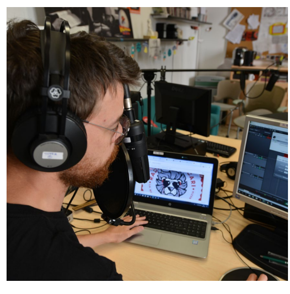
Ca' Foscari Radio Cultural activities