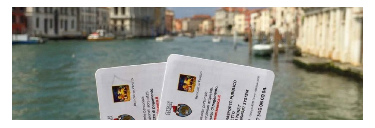
Venezia Unica Card