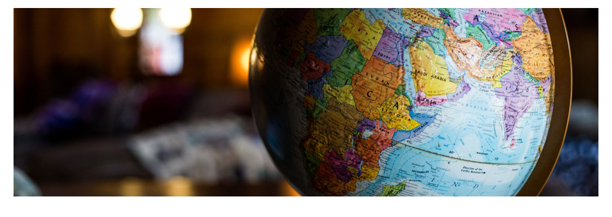
International outgoing mobility