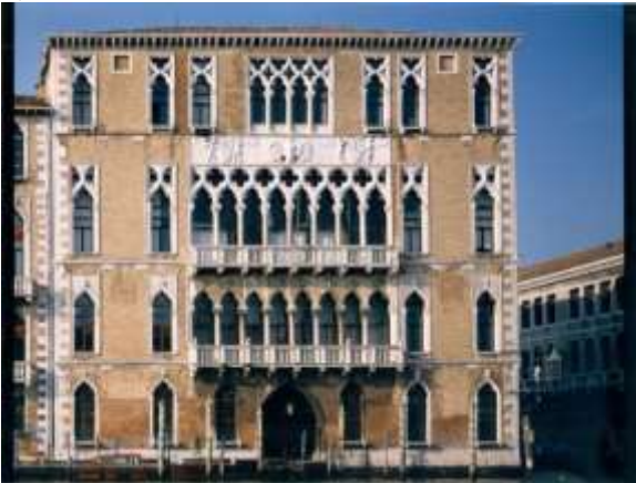
Ca' Foscari's façade

Palazzo Foscari (“Ca’ Foscari”, as called by Venetians), seat of Ca’ Foscari University of Venice: façade on the Grand Canal