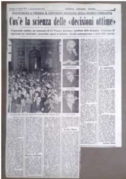
Press Release reproduction: Chronicles of the International Congress on Operative Research, Palazzo Ducale, June 23rd 1969

The International Congress on Operative Research (5, International IFORS Conference) was held at Palazzo Ducale on June 23rd 1969, on the initiative of Ca' Foscari renowned mathematician prof. Mario Volpato.