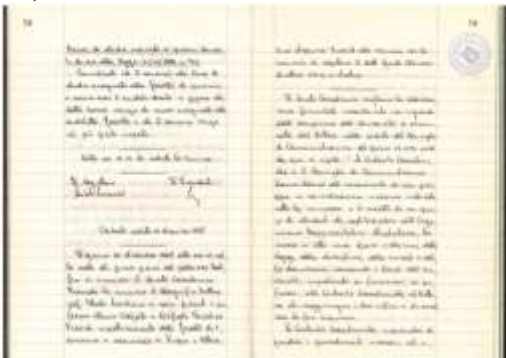
Minutes of the Academic Senate: Debates on students' occupation, December 16th 1967

The centenary of Ca’ Foscari took place during student’s occupations. Students organized demonstrations and occupations in the seats of Ca’ Foscari. In the minutes of the Academic Senate of December 16th 1967 exhibited here the official position of the university following an occupation is presented.