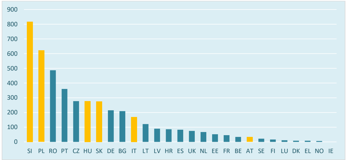
Figure 3: IMI requests on posting of workers by receiving Member State, 2019

In terms of requests received, Slovenia and Poland received the highest number of requests in 2019 comparatively across the EU, which is understandable considering that they are also among the main sending countries of posted workers.