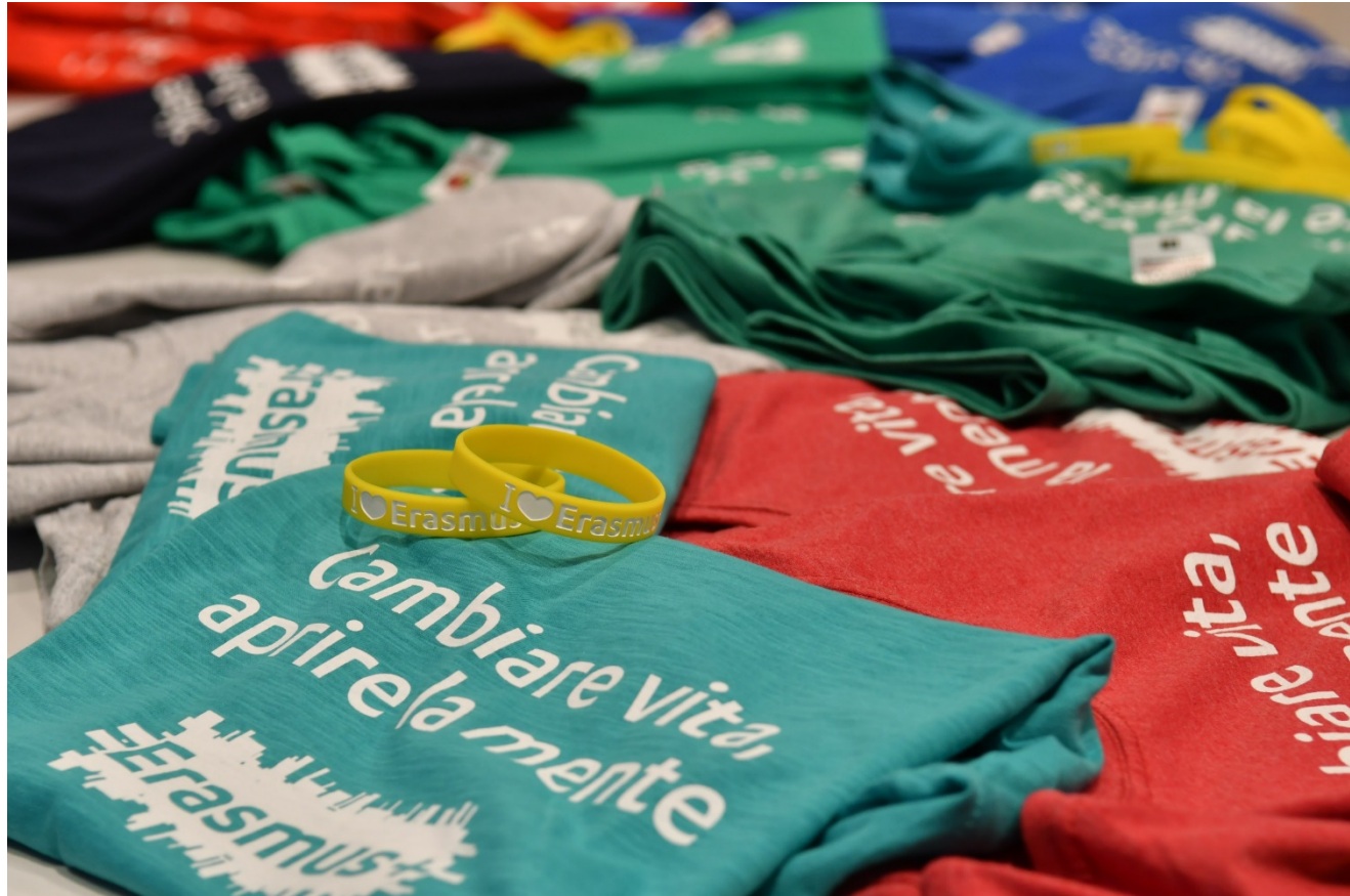
Photo taken during the 2019 Erasmus Days