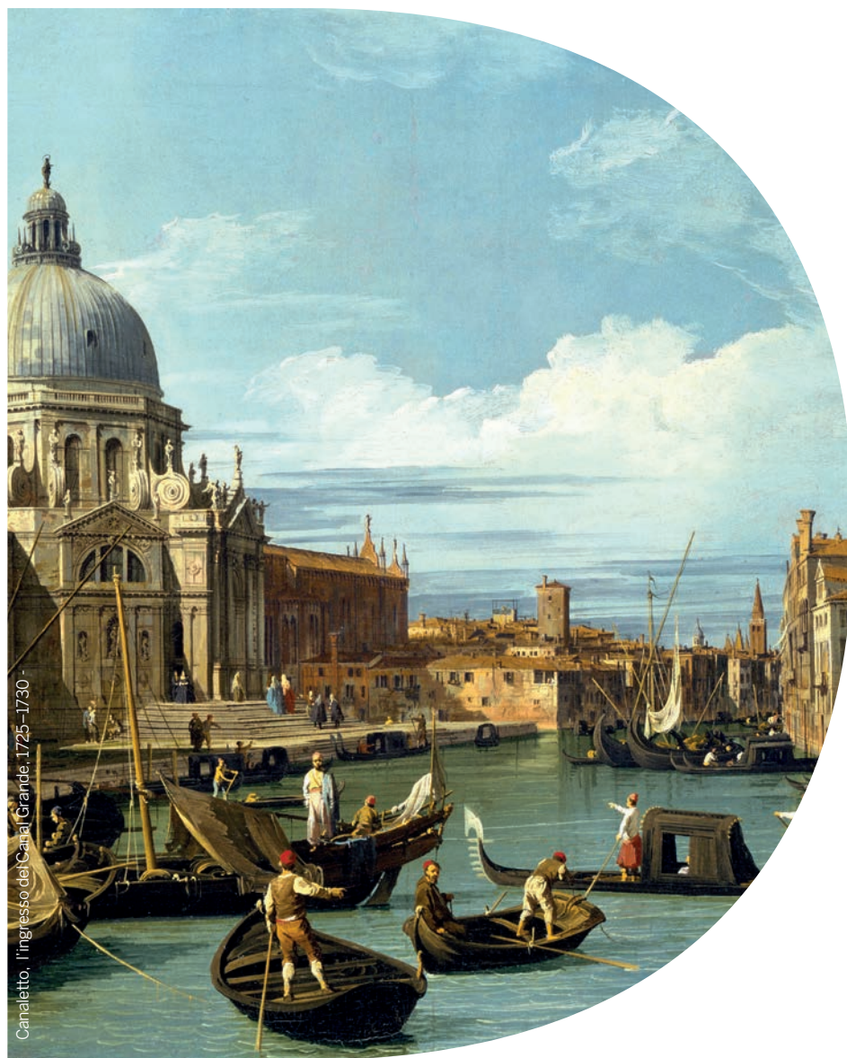
Canaletto, "Ingresso del Canal Grande, 1725-1730"