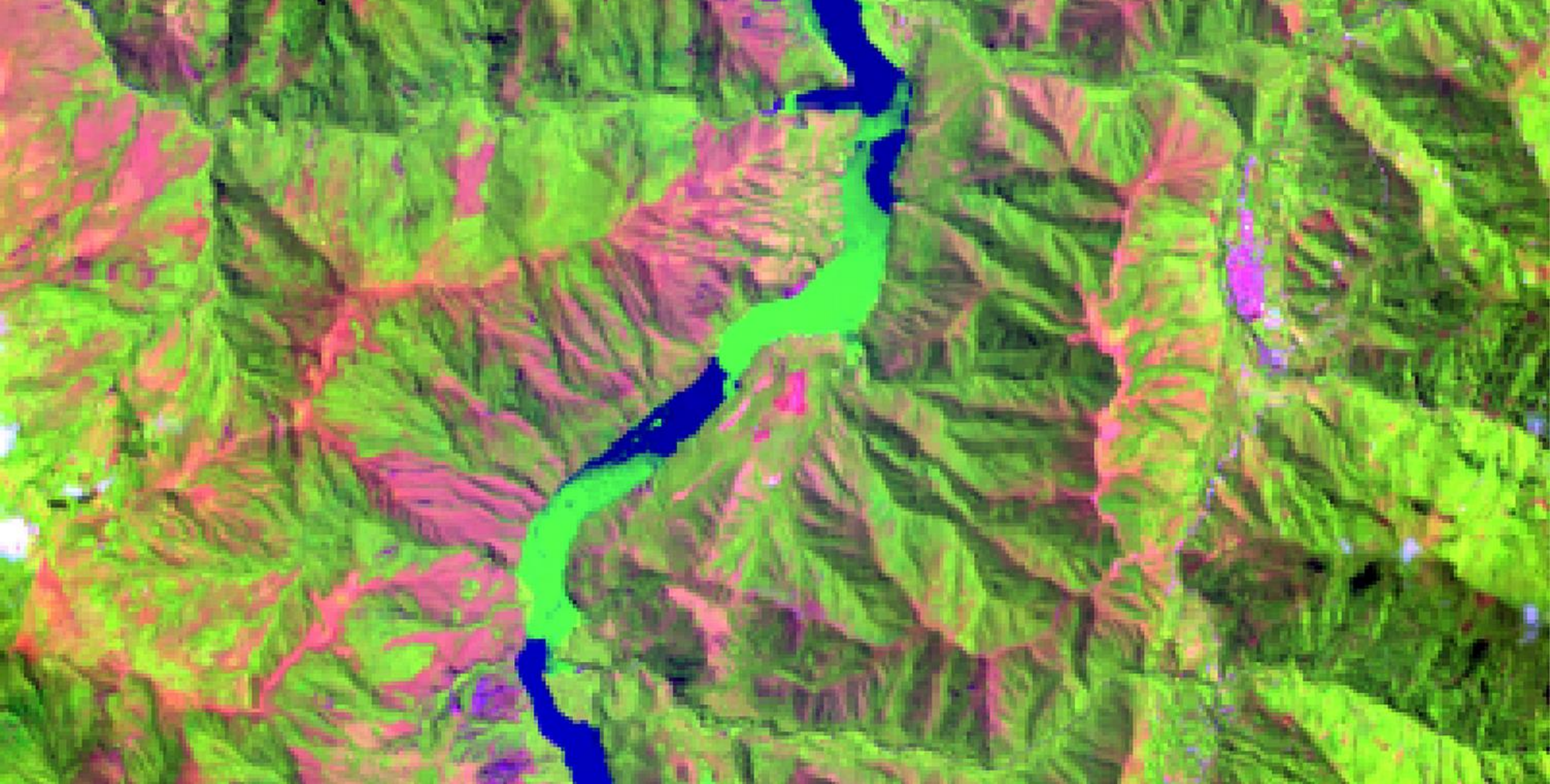
Water Hyacinth growth (between February and July 2019) on the surface of the Hidroituango reservoir near the town of Sabanalarga, Antioquia province, Colombia. Landsat 8 (band combination: 4-3-2) (17/07/2019).