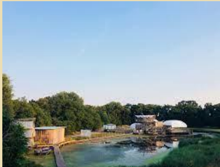
Floating University, Berlin