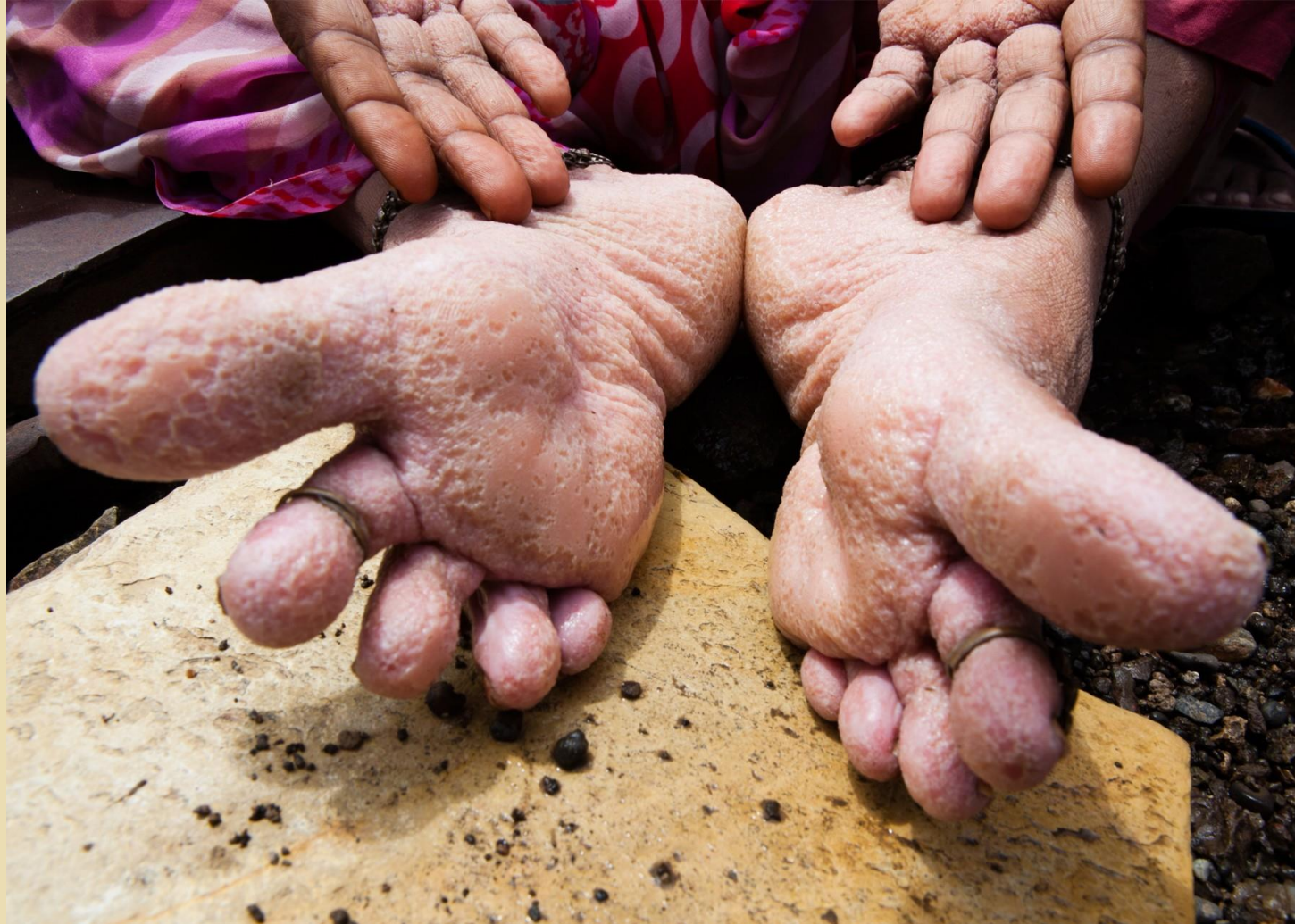
Nandan Saxena and Kavita Bahl, Dammed , 2011 (still)