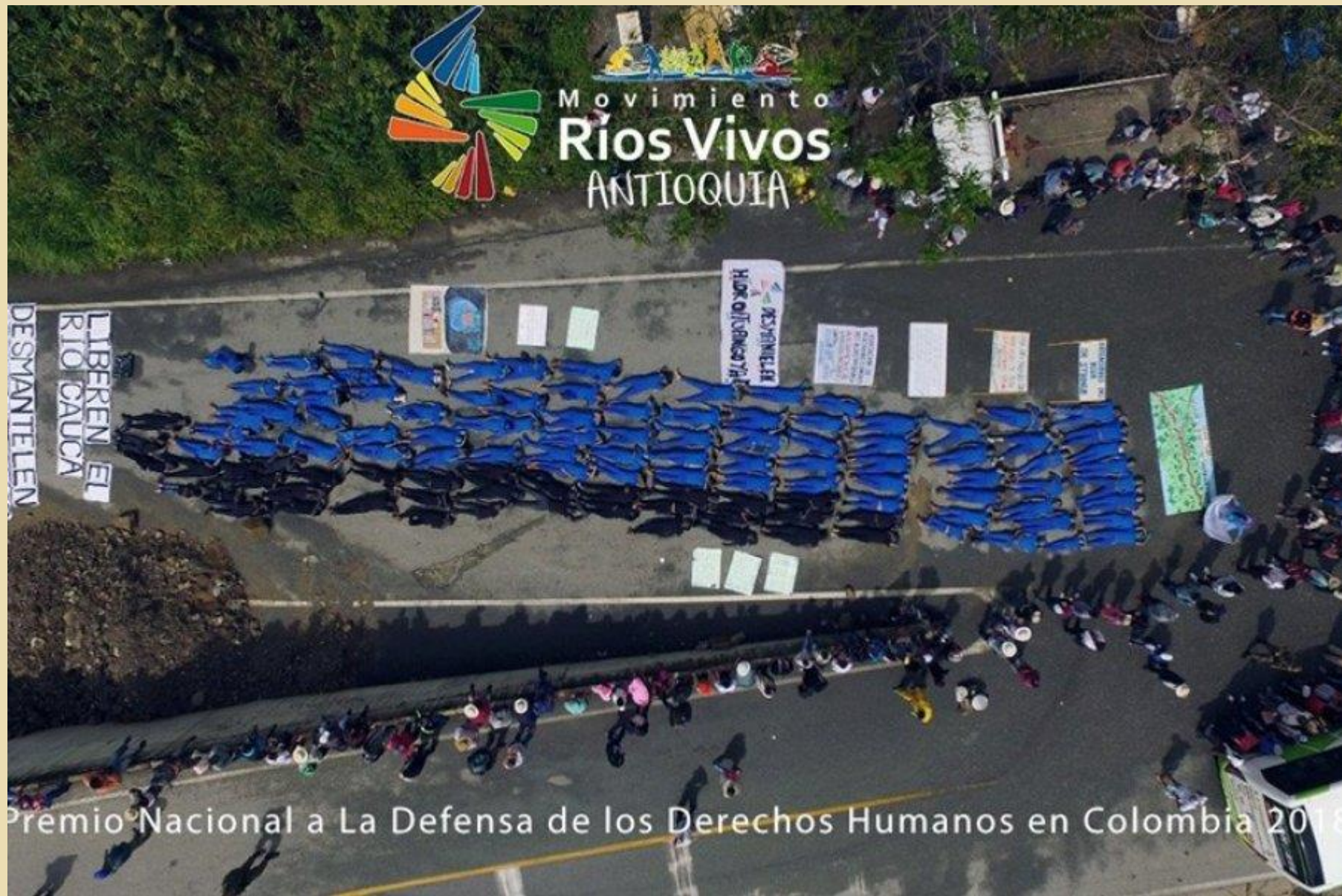
“Ríos para la vida, no para la muerte” Movimiento Ríos Vivos, Antioquia, Colombia.