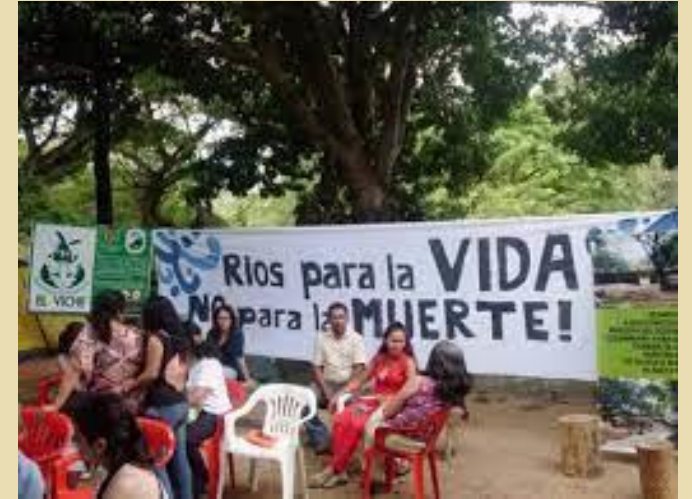
River defenders like Movimiento Rios Vivos, Colombia