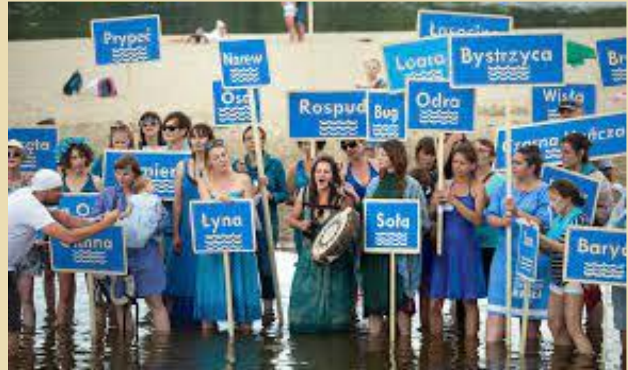
Siostry Rzeki (River Sisters), Poland