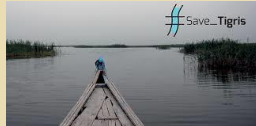
Save the Tigris campaign, Iraq