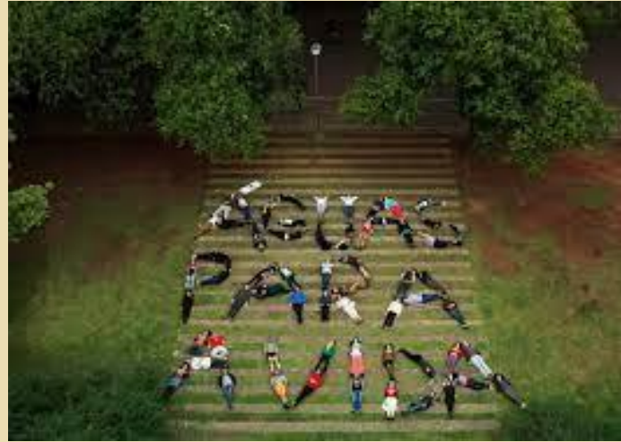
Activist Art practices like Carolina Caycedo