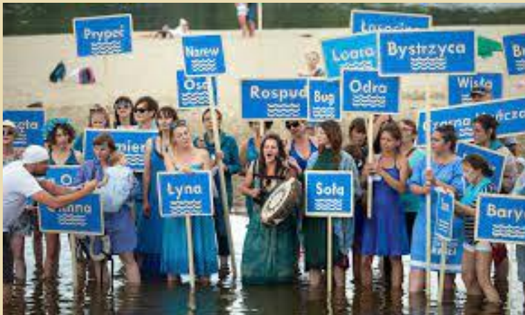
Siostry Rzeki (River Sisters), Poland