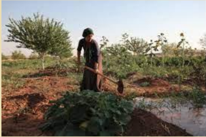
Water for Rojava